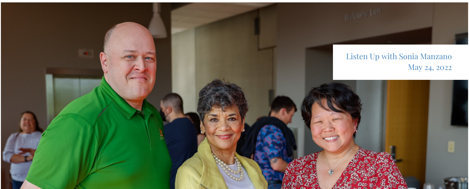
Listen Up with Sonia Manzano May 24, 2022

WFYI's community engagement team worked to reflect our journalists' broader reach, partnering with local Black-owned newspaper The Indianapolis Recorder, educators, health systems and other public media agencies. Through a mix of listening sessions, community conversations and outreach activities, WFYI staff also worked to both obtain essential election questions from the public and to have reporters answer those questions over the summer and fall. In the virtual space, WFYI's team presented a series of Twitter and Facebook Live events featuring experts and community members.